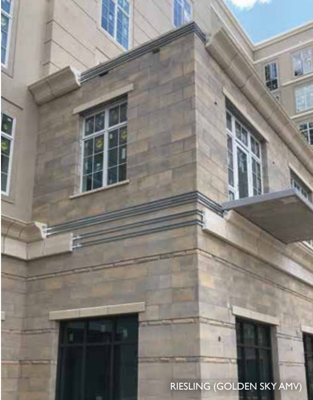
RIESLING (GOLDEN SKY AMV)