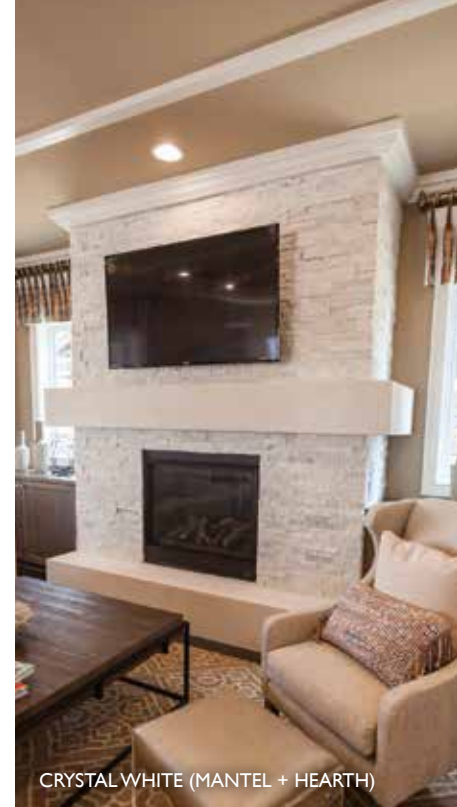
CRYSTAL WHITE (MANTEL + HEARTH)