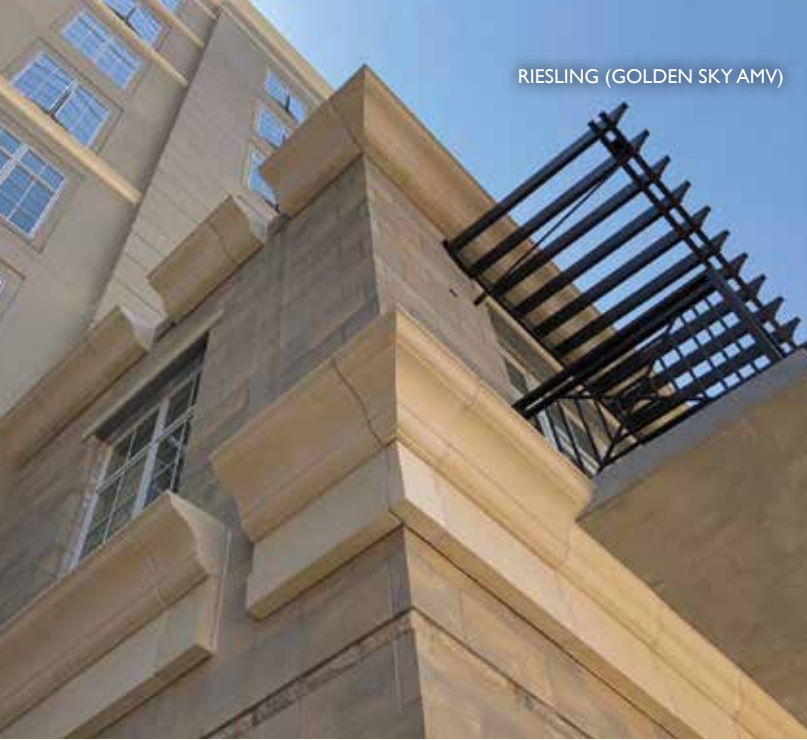
RIESLING (GOLDEN SKY AMV)